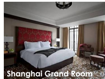
Shanghai Grand Room