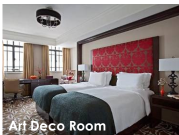
Art Deco Room