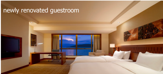
newly renovated guestroom