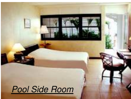
Pool Side Room