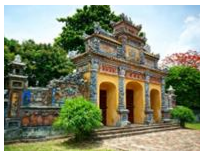
Hue Imperial Citadel