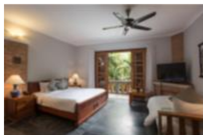
Pilgrimage Villa Resort & Spa Superior Room